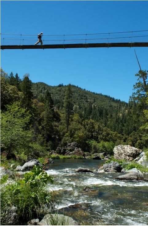
Hayfork Creek

Northwest California is one of the most beautiful places on earth. Stretching from Humboldt County's fog-shrouded redwood forests to the sunny oak woodlands and grasslands of Mendocino, this breathtaking region reaches up to the peaks of the Trinity Alps Wilderness and across the turquoise waters of the Wild & Scenic Smith River.